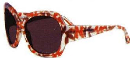
SHADY LADY Badgley Mishka Euphoria sunglasses, $330, ILORI Luxury Sunglasses Boutique (95A Bloor St. W., 416-928-9385)