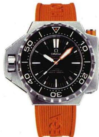
ON THE CLOCK Seamaster Ploprof 1200 m OMEGA Co-Axial watch, $9,350, Birks (page 61)