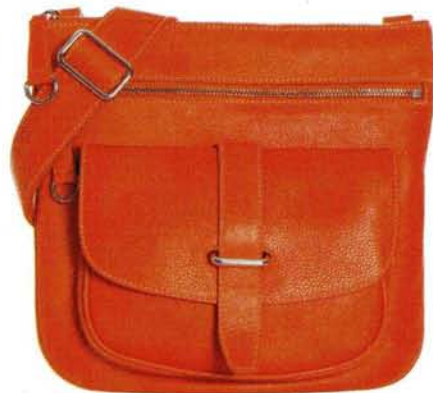
TANGERINE DREAM Side saddle bag in orange creamsicle, $198, Roots (page 58)