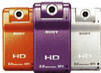
DIRECTOR'S CUT Sony Mobile HD Snap digital and video camera, $229.99, Sony Style (Toronto Eaton Centre, 416-971-7589)